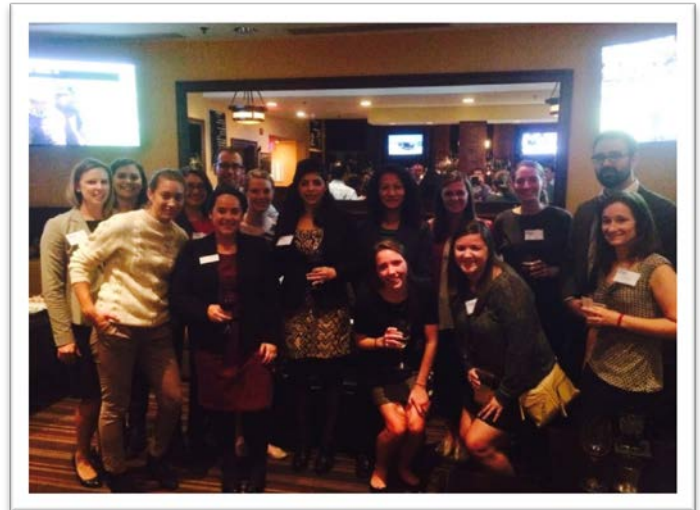
Pictured: Attendees of the Fall WiA Networking Social